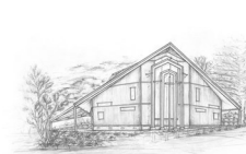
ST PETER'S ONEROA WAIHEKE ISLAND