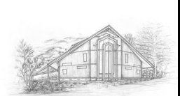
ST PETER'S ONEROA WAIHEKE ISLAND