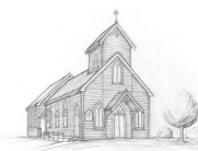
ST JOHN THE BAPTIST 244 PARNELL ROAD AUCKLAND 1052