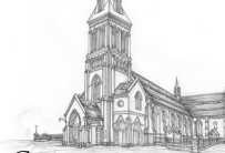
CATHEDRAL OF ST PATRICK & ST JOSEPH 43 WYNDHAM ST, AUCKLAND 1010