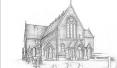
ST BENEDICT'S 1 ST BENEDICT'S ST NEWTON