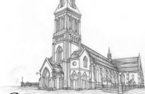
CATHEDRAL OF ST PATRICK & ST JOSEPH 43 WYNDHAM ST, AUCKLAND 1010