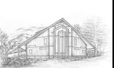
ST PETER'S ONEROA WAIHEKE ISLAND