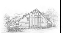
ST PETER'S ONEROA WAIHEKE ISLAND