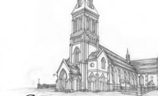
CATHEDRAL OF ST PATRICK & ST JOSEPH 43 WYNDHAM ST, AUCKLAND 1010