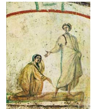
A very ancient picture of Jesus healing the women with the haemorrhage.