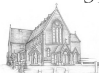
ST BENEDICT'S 1 ST BENEDICT'S ST NEWTON