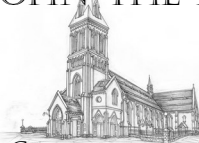
CATHEDRAL OF ST PATRICK & ST JOSEPH 43 WYNDHAM ST, AUCKLAND 1010