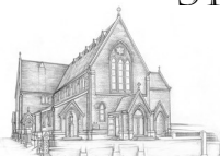
ST BENEDICT'S 1 ST BENEDICT'S ST NEWTON