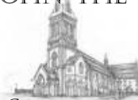
CATHEDRAL OF ST PATRICK & ST JOSEPH 43 WYNDHAM ST, AUCKLAND 1010