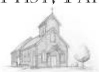
ST JOHN THE BAPTIST 244 PARNELL ROAD AUCKLAND 1052