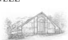
ST PETER'S ONEROA WAIHEKE ISLAND