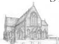
ST BENEDICT'S 1 ST BENEDICT'S ST NEWTON