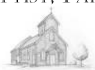
ST JOHN THE BAPTIST 244 PARNELL ROAD AUCKLAND 1052