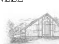
ST PETER'S ONEROA WAIHEKE ISLAND