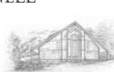
ST PETER'S ONEROA WAIHEKE ISLAND