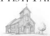
ST JOHN THE BAPTIST 244 PARNELL ROAD AUCKLAND 1052