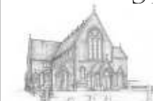
ST BENEDICT'S 1 ST BENEDICT'S ST NEWTON