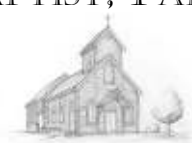
ST JOHN THE BAPTIST 244 PARNELL ROAD AUCKLAND 1052