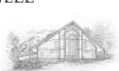
ST PETER'S ONEROA WAIHEKE ISLAND