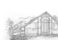
ST PETER'S ONEROA WAIHEKE ISLAND