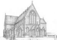
ST BENEDICT'S 1 ST BENEDICT'S ST NEWTON