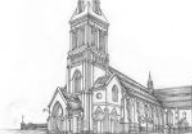
CATHEDRAL OF ST PATRICK & ST JOSEPH 43 WYNDHAM ST, AUCKLAND 1010