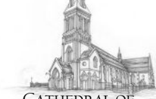
CATHEDRAL OF ST PATRICK & ST JOSEPH 43 WYNDHAM ST, AUCKLAND 1010