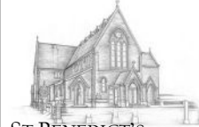
ST BENEDICT'S 1 ST BENEDICT'S ST NEWTON