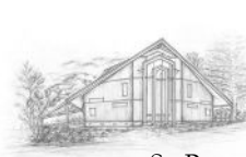
ST PETER'S ONEROA WAIHEKE ISLAND