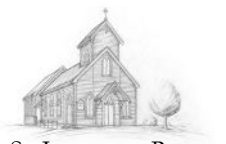
ST JOHN THE BAPTIST 244 PARNELL ROAD AUCKLAND 1052