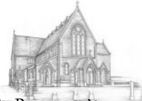
ST BENEDICT'S 1 ST BENEDICT'S ST NEWTON