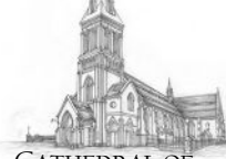
CATHEDRAL OF ST PATRICK & ST JOSEPH 43 WYNDHAM ST, AUCKLAND 1010