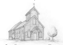
ST JOHN THE BAPTIST 244 PARNELL ROAD AUCKLAND 1052