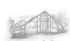
ST PETER'S ONEROA WAIHEKE ISLAND