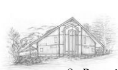
ST PETER'S ONEROA WAIHEKE ISLAND