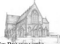
ST BENEDICT'S 1 ST BENEDICT'S ST NEWTON