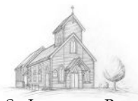
ST JOHN THE BAPTIST 244 PARNELL ROAD AUCKLAND 1052