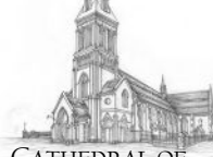
CATHEDRAL OF ST PATRICK & ST JOSEPH 43 WYNDHAM ST, AUCKLAND 1010