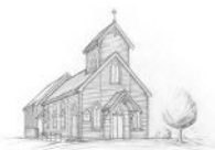
ST JOHN THE BAPTIST 244 PARNELL ROAD AUCKLAND 1052