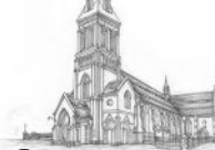
CATHEDRAL OF ST PATRICK & ST JOSEPH 43 WYNDHAM ST, AUCKLAND 1010