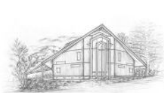
ST PETER'S ONEROA WAIHEKE ISLAND