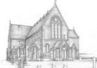
ST BENEDICT'S 1 ST BENEDICT'S ST NEWTON