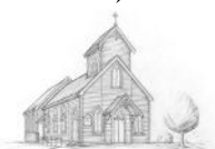
ST JOHN THE BAPTIST 244 PARNELL ROAD AUCKLAND 1052