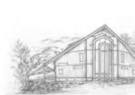
ST PETER'S ONEROA WAIHEKE ISLAND